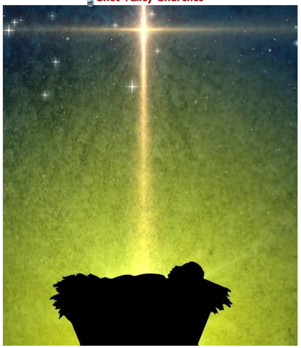
Holy Communion Second Sunday of Christmas 2nd January 2022