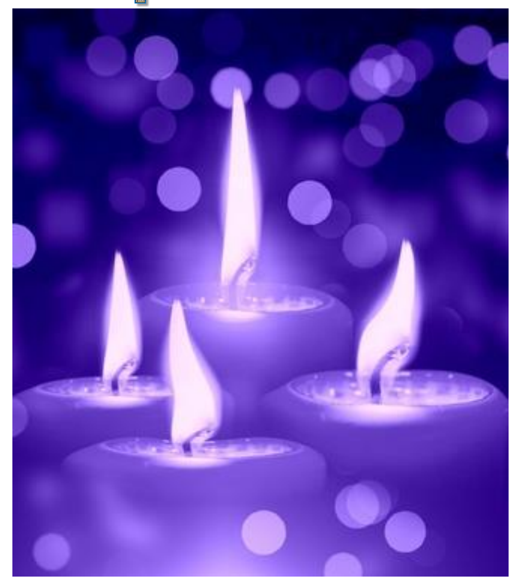
Holy Communion for Advent Sunday