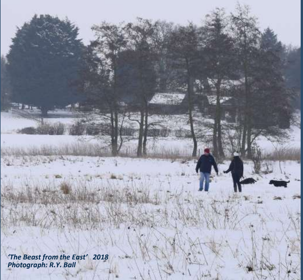
'The Beast from the East' 2018

Published by the Church in Loddon February 2019