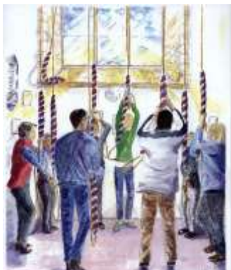
Watercolour of the ringers in action

We then gathered at St. Peter Mancroft to ring the Twelve bells from the new gallery which has been installed higher up in the tower. Underneath this is the training centre itself. Eight dummy bells are connected to a computer system to allow new ringers to learn the art without any